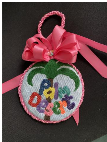
“Palm Desert” by Danji Designs