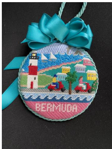
“Bermuda” by Doolittle Stitchery