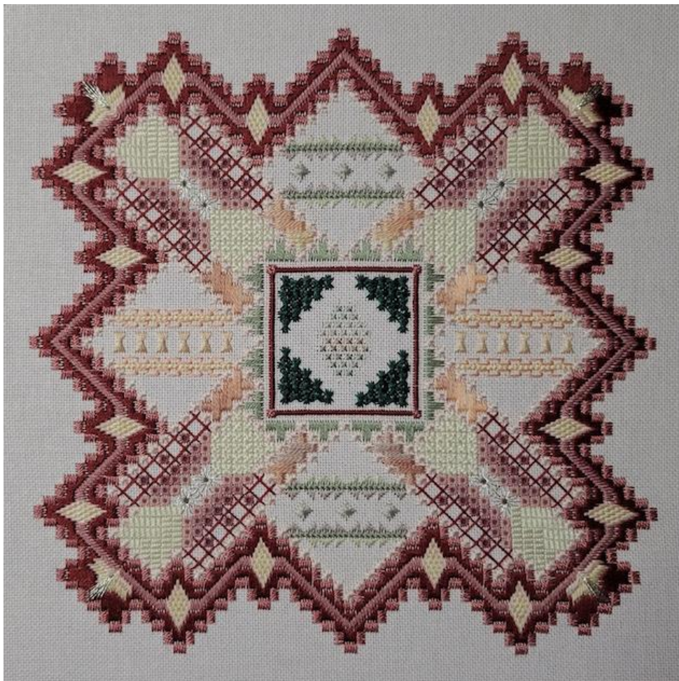
Cathryn Curia - Ornaments Stitch & thread choices by Cathryn

"This piece was a counted thread done on 28 count Carnation Pink Jubilee and includes a new & unique stitch called the Vault Stitch which would be good for tree tops. I plan to try a frameless mounting for finishing."